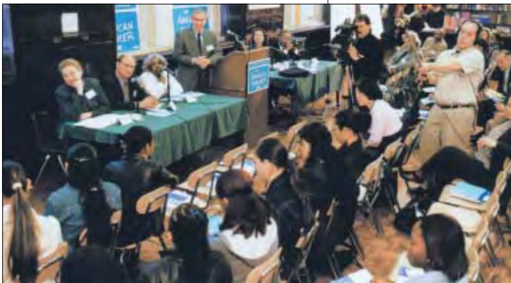
The MetLife-CED New York Roundtable was held at Washington Irving High School in Manhattan on April 26, 2001. This Roundtable focused on parental involvement in education.

that directly affect them and whether or not their schools are preparing them for life and work.