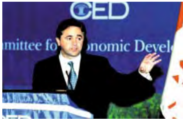
Brian Tobin , Canada's Minister of Industry, gave the keynote address at CED's Forum on "The Digital Economy and North American Economic Growth."

Early in 2001, CED released The Digital Economy: Promoting Competition, Innovation, and Opportunity with the Internet Education Foundation (affiliated with the Internet Caucus of Congress). Representative Robert Goodlatte , Co-chair of the Internet Caucus, was the keynote speaker.