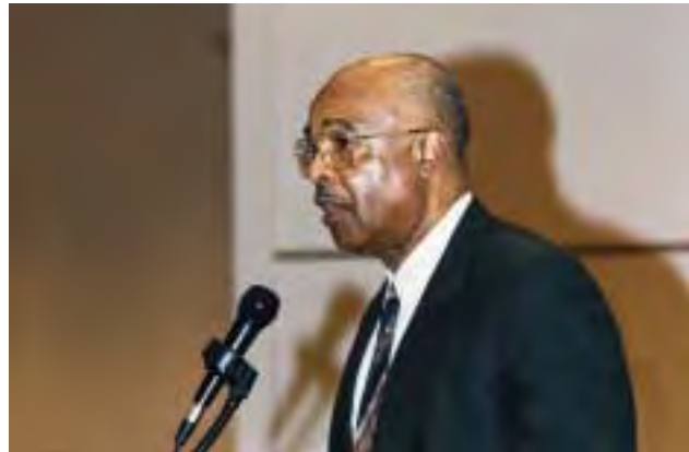
Rod Paige , U.S. Secretary of Education (then-Superintendent of Houston's Schools) spoke at the MetLife-CED Roundtable on Education in Houston. The MetLife Foundation and CED conducted this Roundtable with the aid of the Greater Houston Partnership and the Texas Business Education Partnership.

individual communities, The MetLife Foundation and CED conducted a series of education dialogues in five cities. These Roundtables provided an opportunity for teachers, parents, school administrators, and students to talk openly about the issues